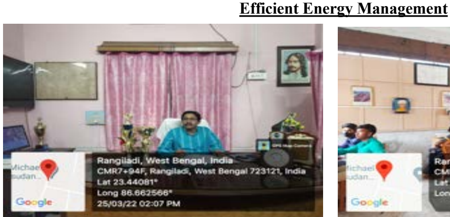
Sensor at the Principal Room