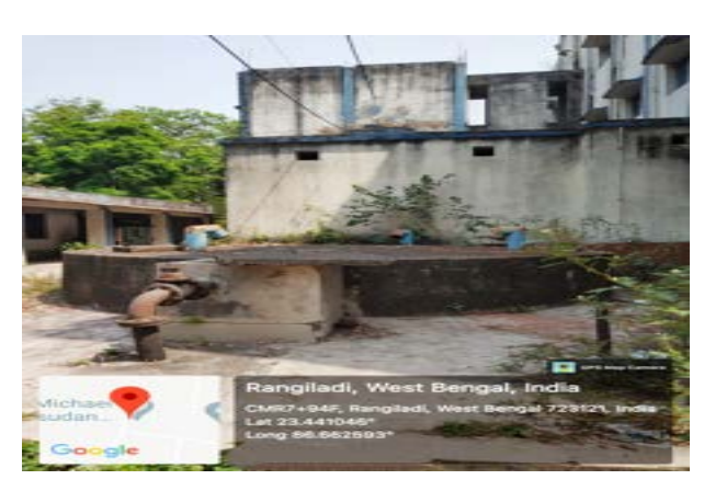
Distribution from 2<sup>nd</sup> Reservoir