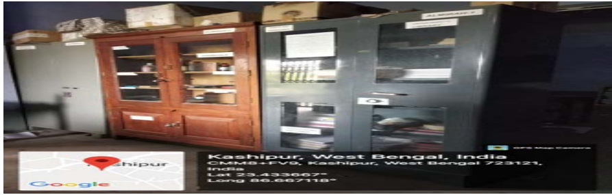
Store of Laboratory Waste (Zoology) Water Supply, Reservation and Distribution