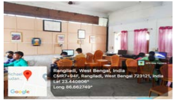
Sensor at the GIS Lab