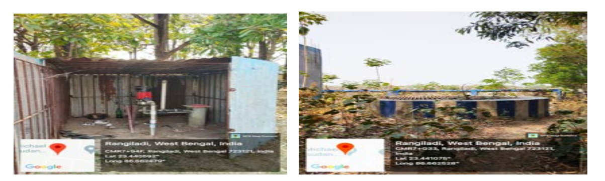
Water Supply (Pump)