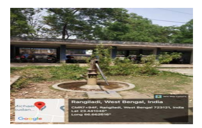
Bore Well (for Drinking)